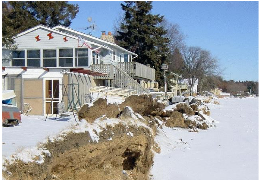
Ice ridge formed along the shore of Shamineau Lake in Morrison County.

Property owners occasionally return to their cabins in the spring only to discover they are dealing with property damage caused by a phenomenon called “ice heaving” or “ice jacking”. This powerful natural force forms a feature along the shoreline known as an “ice ridge”. The result may include significant damage to retaining walls, docks and boat lifts, and sometimes even to the cabin itself.